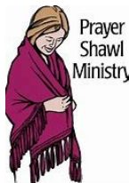
Prayer Shawl Ministry