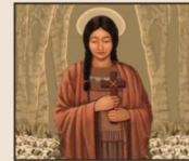
St. Kateri Tekakwitha Lily of the Mohawks

Our parish has a FORMED subscription. To set up your free account visit formed.org/signup and select our parish.