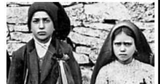
St. Francisco and St. Jacinta's Feast day is February 20.