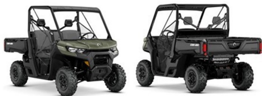
2020 CAN-AM Defender DP5 HD5